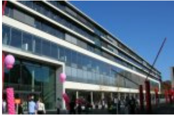
University of Fribourg: the new building “Pérolles II”

The buses no. 1 direction “Marly”, no. 3 direction “Pérolles” or no. 7 direction “Cliniques” leave from the train station every few minutes. You always should get off at the bus stop “Charmettes”.