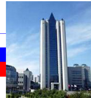
Gazprom Headquarters, Moscow