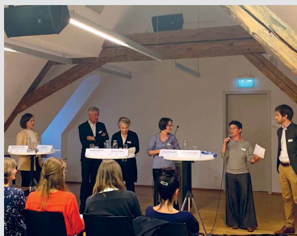
Panel discussion on the possible adoption of a cantonal UPR