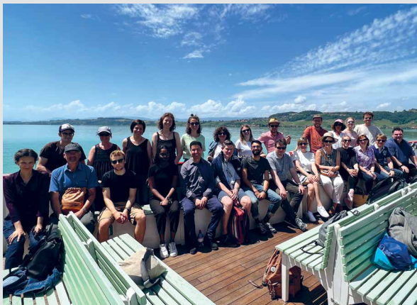
Day out at Lake Murten/Mont Vully, June 2022

The day trip to Vully in summer and the Christmas party, which took place in the wider Bulle region, were an opportunity for the Institute team to unwind, connect at a personal level and strengthen their professional rapport.