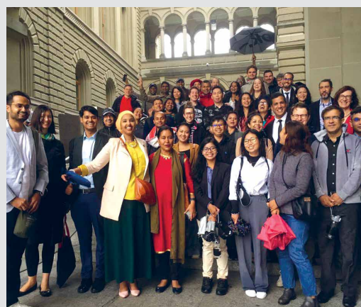
Snapshots of the 2022 Summer University