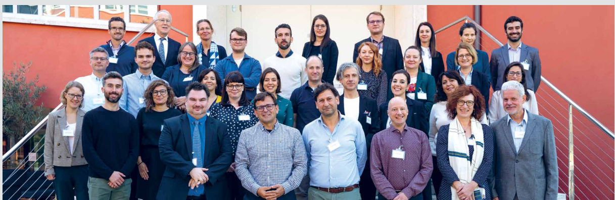
LEGITIMULT kick-off event, 17.10.2022, Bolzano