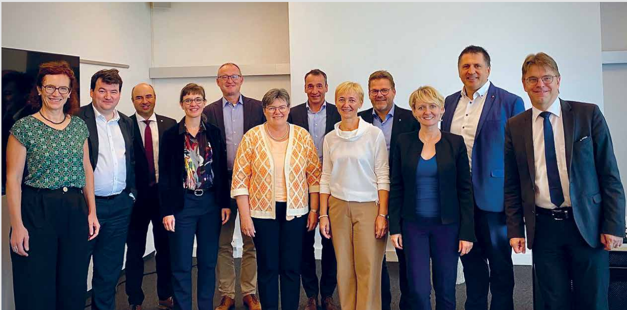
Constitutional law seminar for cantonal government members, 15.9.2022

Further seminars are planned for 2023. Cantonal government elections will be held in Zurich, Basel-Landschaft, Appenzell-Ausserrhoden, Lucerne, Ticino and Geneva next year as well. Naturally, the seminars are open to all cantonal government members.