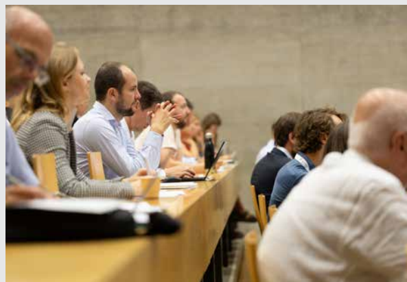
1 st Journées du Fédéralisme de Fribourg / 1. Freiburger Föderalismus-Tage from 7 – 8 September 2023

The inaugural Journées du Fédéralisme de Fribourg/Freiburger Föderalismus-Tage proved to be a success. With close to 100 attendees including federalism scholars, practitioners and other interested parties, the event offered a platform for a fundamental,