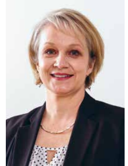
Florence Nater, Member of the Cantonal Government, Neuchâtel

I hope that through the collective and constructive efforts of all three levels of government, «applied federalism» can continue to nurture social cohesion in Switzerland in 2024 and for years to come.