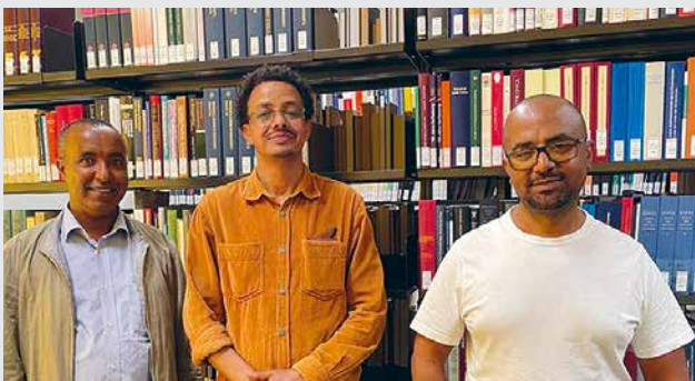
Three visiting researchers

A few years ago, the ch Foundation for Federal Cooperation expressed a desire to create a continuing education platform exclusively given over to federalism. A multipartite structure (consisting of the Council of States, the Federal Office of Justice, the ch Foundation, the Swiss Association of Communes and the Swiss Association of Cities), developed a concept for an ad hoc seminar and commissioned the Institute to implement it. The first seminar was planned for January 2021, but had to be postponed twice due to the Covid-19 pandemic. For the organisers, it was a case of third time lucky: the inaugural Federalism Seminar was held from 24 to 26 May 2023 in Schwarzenberg (canton of Lucerne). More than 40 participants explored the constitutional building blocks of the Swiss federal state and discussed the practical challenges that federal Switzerland currently faces. Following a general introduction to the subject, participants examined a wide range of issues, including the territorial organisation of the federal State; the division of powers and responsibilities; fiscal federalism; federal loyalty; and cooperation on the performance of tasks; and the contribution of the cantons, communes and cities to shaping federal political will. Workshops enabled participants to explore these topics in greater depth using real-life cases (e.g. e-Government and public health care).