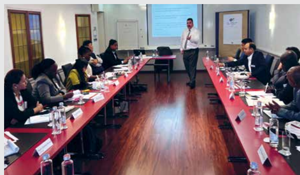
Participants of the Practitioners' Course from 7 – 18 August 2023 in Murten

The Institute would like to thank the participants, our partners who hosted us and shared their experiences, as well as our sponsors, especially the Federal Department of Foreign Affairs (FDFA) and the Swiss Agency for Development Cooperation (SDC), who were critical in getting the 2023 Practitioners' Course off the ground.