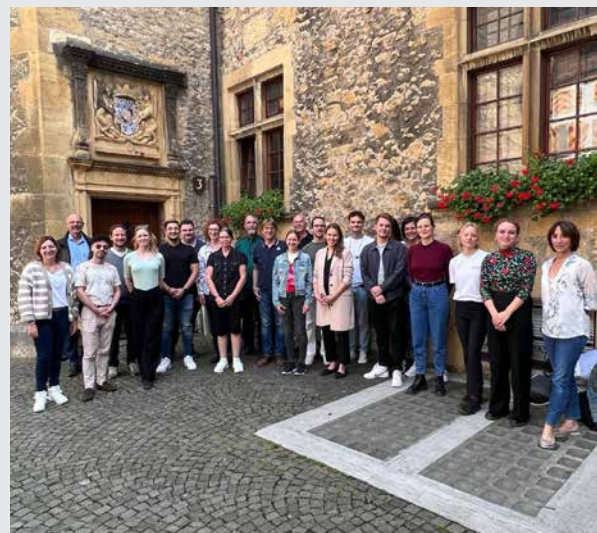
Day trip to Neuchâtel

The arrival of a third-year commercial apprentice brought a welcome breath of fresh air to the Institute. One of the primary beneficiaries of his excellent and much appreciated work in 2023 was the Institute's internal accounting activities.