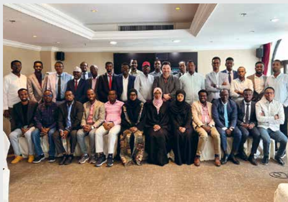
Participants of the IGFFTC at the seminar «Fiscal Federalism and Power-sharing for Somalia» in Addis Ababa

The workshop was the first in a series of IFF and IGFFTC workshops and exchanges planned for 2024.