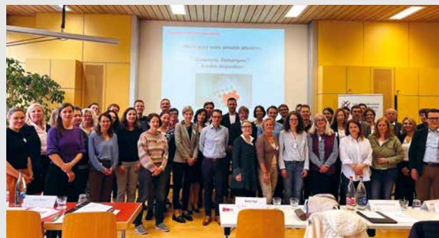
Participants of the federalism seminar from 24 – 26 May 2023 in Schwarzenberg (LU)

The seminar was aimed primarily at professionals working for the public authorities and employees of the federal, cantonal, communal and intercantonal administrations, but was also open to politicians, media professionals and anyone with an interest in constitutional law and public policy issues. The speakers were as