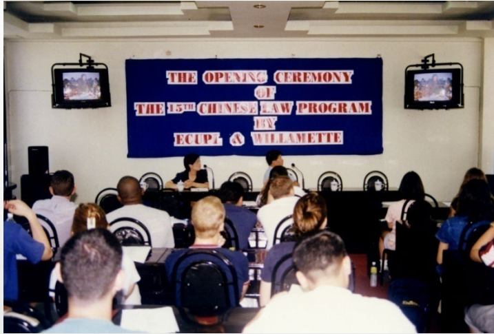
Chinese Law Program in 1988