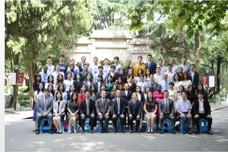
WIPO Summer School in 2019