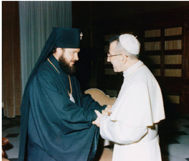
Archbishop (now Patriarch) Kirill with Pope Luciani on September 7, 1978

[With respect to the Pope's words to the Roman clergy on September 7] It was a moment of grace that passed. That the Church missed.