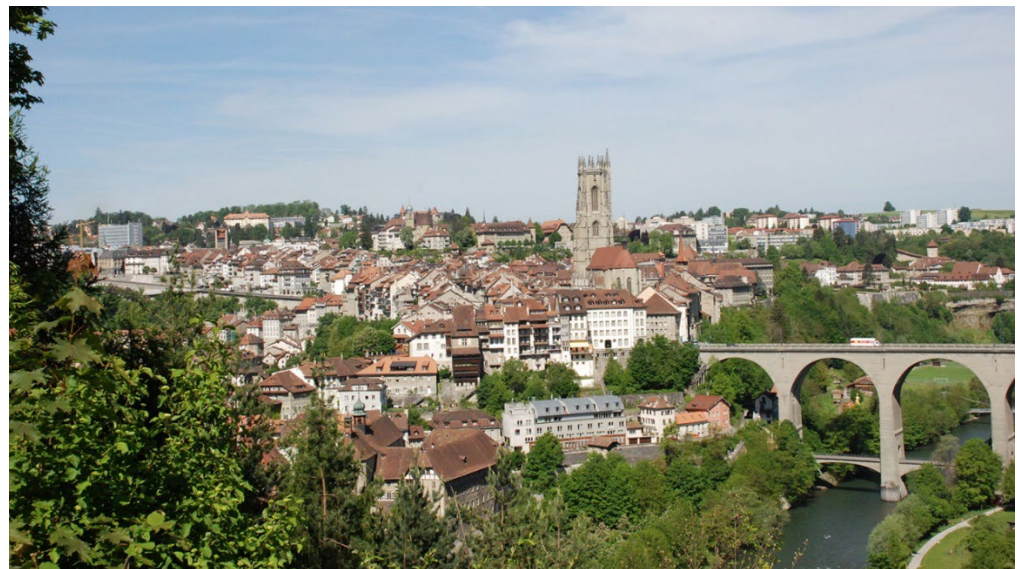
We wish you an unforgettable stay in Fribourg and remain at your disposal for any questions you may have!